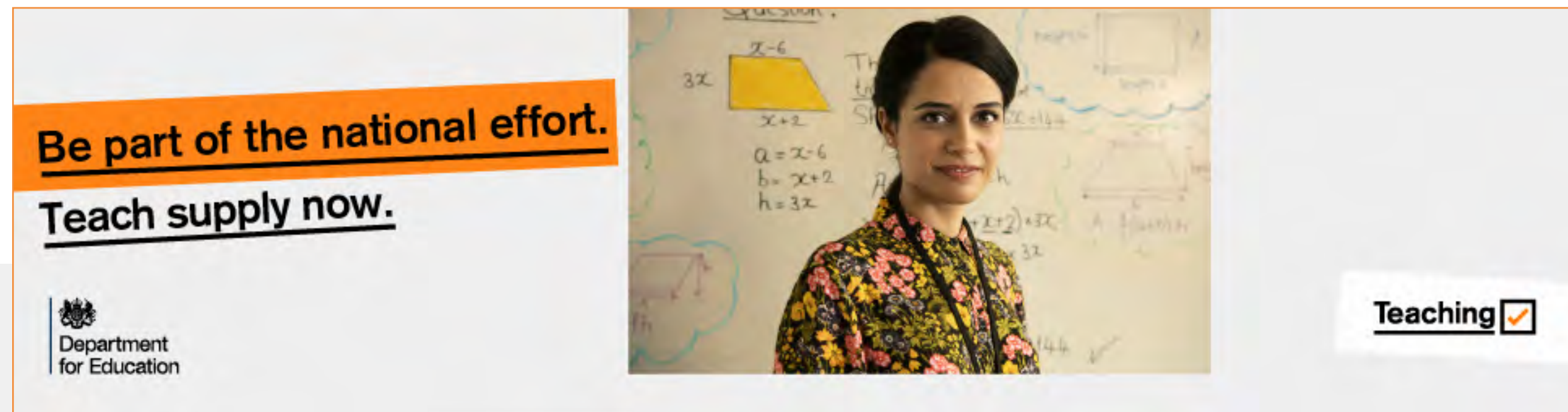
Billboard 970x250 px